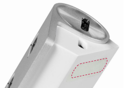
Reinforced anti-slip design