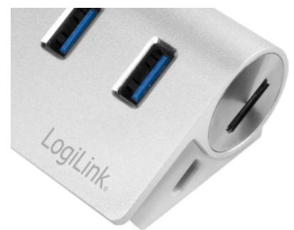
Stylish aluminum design