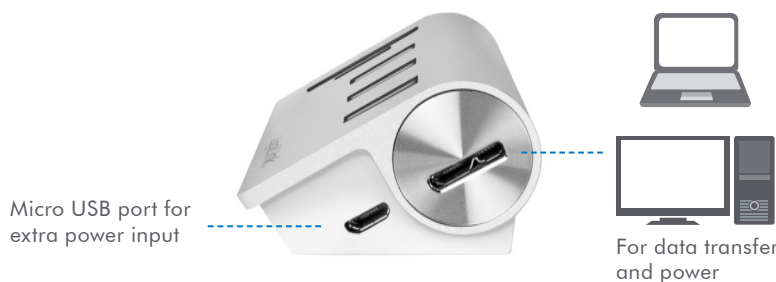
Micro USB port for extra power input